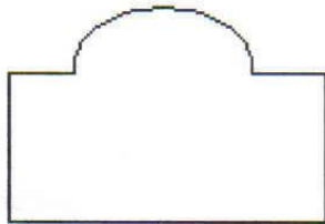
YARD SIGN (LARGE 12" X 20" )

All signs are cast aluminum. Background colors are to be dark green, black or bronze or nickel/chrome. Letters are to be gold, black or white or nickel/chrome contrast with the background color.