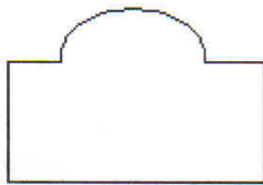
YARD SIGN (LARGE 12" X 20" )

All signs are cast aluminum. Background colors are to be dark green, black or bronze. Letters are to be gold, black or white to contrast with the background color.